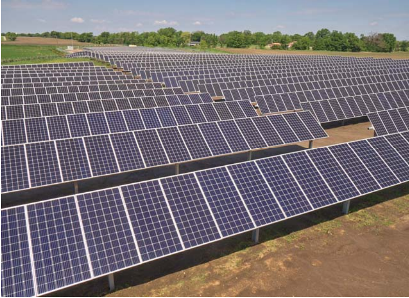
Minnesota Municipal Power Agency's 7 MW Buffalo Solar Buffalo, MN